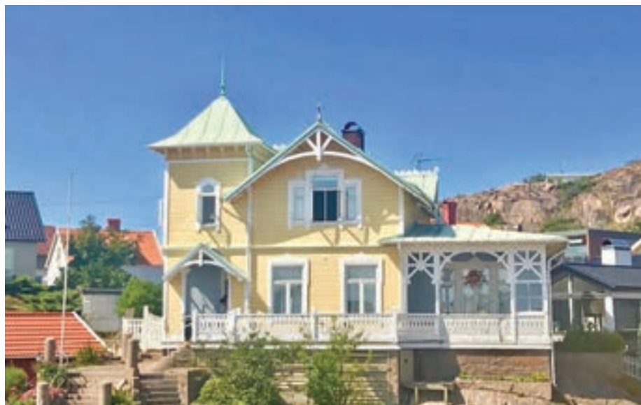
Gula Villan (The Yellow House), built in 1897 and now part of Strandflickornas Hotel (The Beach Girls' Hotel), is where we stayed in Lysekil, Sweden.

tractor-trailers we met head-on. We parked in a 10-story parking garage in Oslo that gave about one inch clearance on each side of the V60 as we searched for our spot (thank goodness for the 360-degree camera!). We kayaked in gorgeous and ice-cold fjords. We bicycled in tiny mountain villages and gorgeous Oslo in the rain. We ate brown cheese in villages totally cut off from road traffic. We hiked exten-