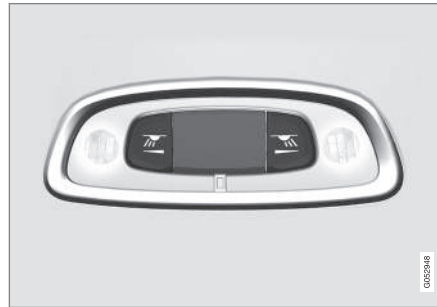
Reading lights over the rear seat.

Reading lights are located in the rear section of the vehicle and can also be used as passenger compartment lighting.