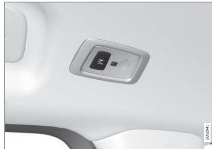
In vehicles with panoramic roofs*, there are two lamp units, one on each side of the ceiling.

Briefly press the button on the light to turn on or off the reading lights. To adjust the brightness, press and hold the button.